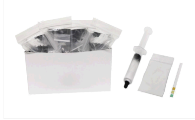
ChannelCheck™ Convenience Pack